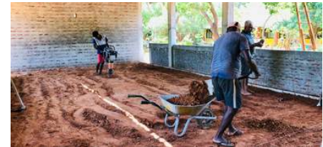
Roofwork completed Plastering & Concreting Commenced