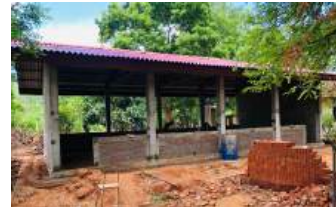
Osuwinna Kanishta Vidyalaya Project Cost- Rs.9.9 Mn