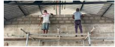
Internal plastering complete External plastering commenced