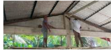
Holy Angel's Girl's School, Payagala Project Cost- Rs.19.5 Mn