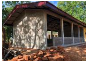
Ranmihithanna Kanishta Vidyalaya Project Cost- Rs.9.9 Mn