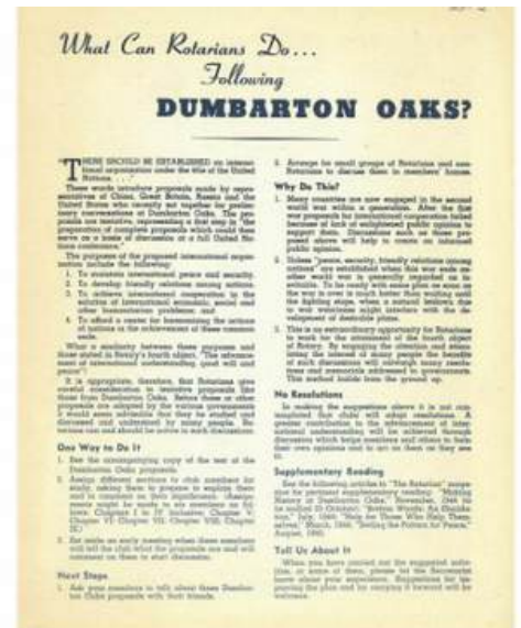
"Timely Questions on Dumbarton Oaks" helped Rotarians understand the complexities of the proposed charter.