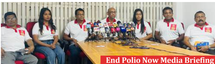
End Polio Now Media Briefing