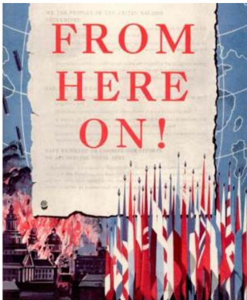
Rotary's presentation of the United Nations charter, "From Here On!"